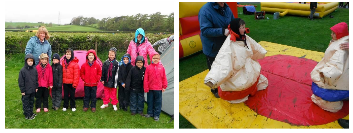
Thanks for a great year and looking forward to seeing you all again in September!

The Beavers also attending the Remembrance Day parade and helped with the fund raising bag pack at Morrisons. Nine of our Beavers also joined with Beavers, Cubs and Scouts from across the county for a wet but fun day out at Cumbaree where they enjoyed drumming, street dance, circus skills, sumo suits and a climbing wall.